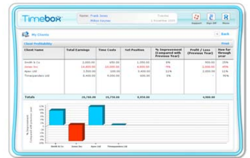
Instant Profitability Position

Timebox combines simplicity of use with powerful management and analytical capabilities. This means you can identify precisely where time is being spent and by whom; which accounts currently generate the most profit and exactly how much time and money is spent servicing each client.