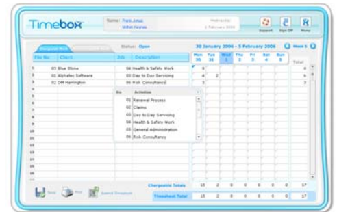
Easy to use Timesheet

Timebox is an imaginative time-recording solution designed to meet the challenges of fee transparency and client profitability. It is an on-line system aimed specifically at helping you to increase income from your clients, to support fee negotiations, and to measure and improve client profitability.